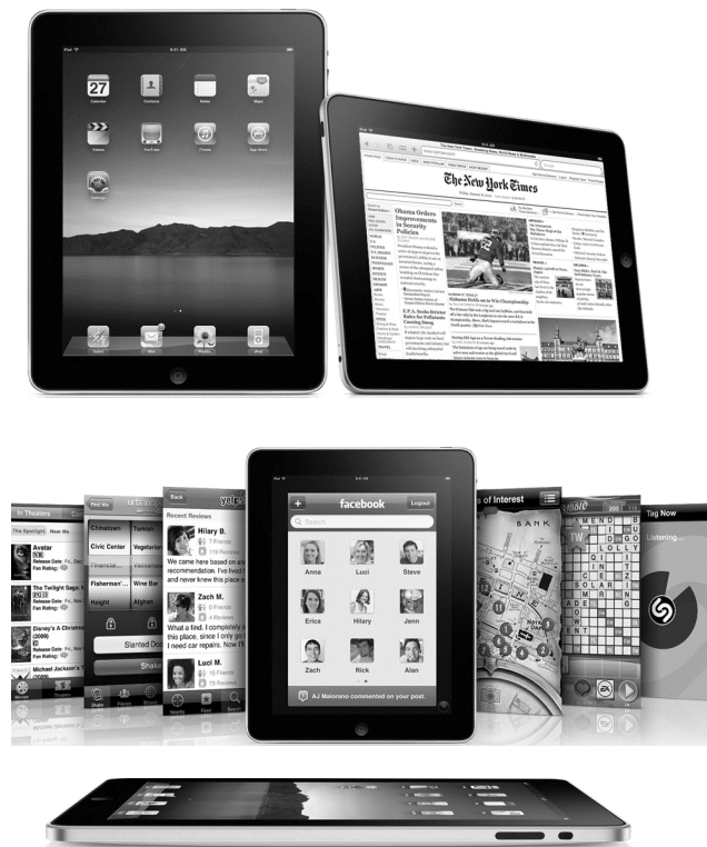
Fig. 1. The Apple iPad, with a few of the 140,000 apps that were already available by the release date

But student adoption of new digital technologies is increasing exponentially and, as argued elsewhere in [15], is affecting student expectations of how teaching and learning should occur. Simultaneously, EFL textbooks are merging with digital media [16]; and more and more teachers are integrating online placement and progress tests, and web-hosted Learning Management Systems into their courses [17].