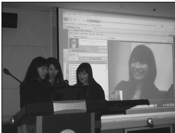
Fig. 4. Korean EFL students of Sejong University in Seoul are shown videoconferencing with Obari's Japanese EFL students of Aoyama Gakuin University in Tokyo, with both parties using their L2 English