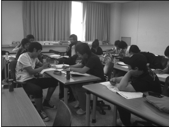
Fig. 2. Flexible groupings of students typically occur in EFL classes, with groupings often rearranging frequently during any class to allow for different group sizes for different tasks and different conversational partners...