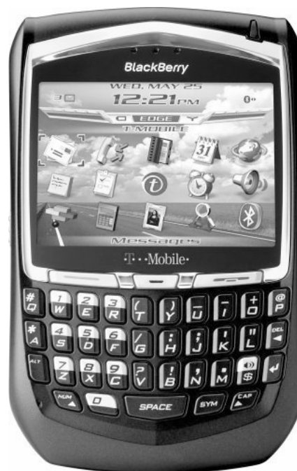
Figure 1. The BlackBerry 8700g [1]

An important application to cell phone usage in the L2 classroom is capturing SMS into a database that is displayed on a message board. Teachers can use computers to send SMS to students, with particular advantages for administrative purposes. The challenge is to ensure permitting cell phone use in class does not open a Pandora's box.