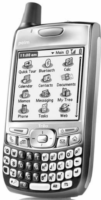
Figure 3. Palm Treo 700p with full QWERTY keyboard (above) and on-screen capabilities (right).

Smart cell phones for SMS and text- messaging, web browsing and streaming video / live TV. The shapes of things to come?