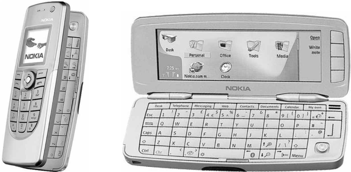
Figure 2. Nokia 9300 Smartphone, which opens to reveal a full QWERTY keyboard

Smart cell phones for SMS and text- messaging, web browsing and streaming video / live TV. The shapes of things to come?